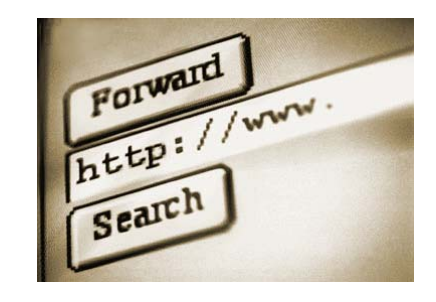
Web enablement is no longer costprohibitive with Document Imaging Solutions, Inc.